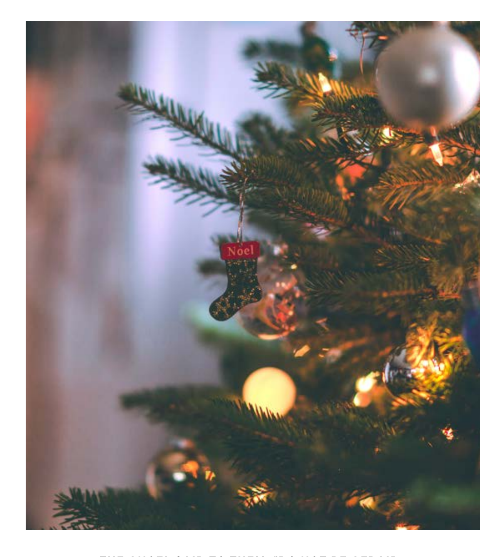
THE ANGEL SAID TO THEM, "DO NOT BE AFRAID. I BRING YOU GOOD NEWS THAT WILL CAUSE GREAT JOY FOR ALL THE PEOPLE.